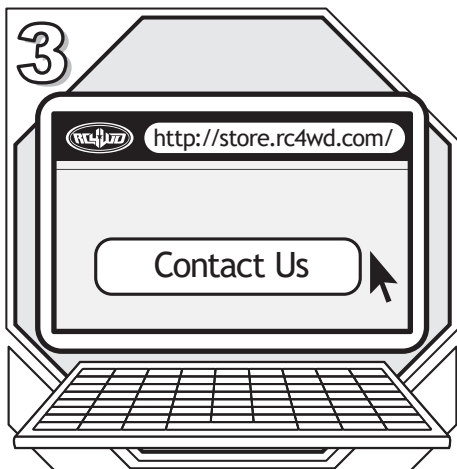
Contact Customer Support